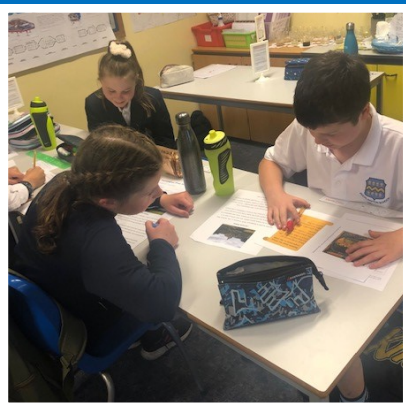
Year 5 investigating sources to find out about the dissolution of the monasteries in Tudor times