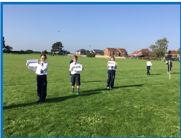
Y5 acting out the revolution of planets round the sun in Science this morning