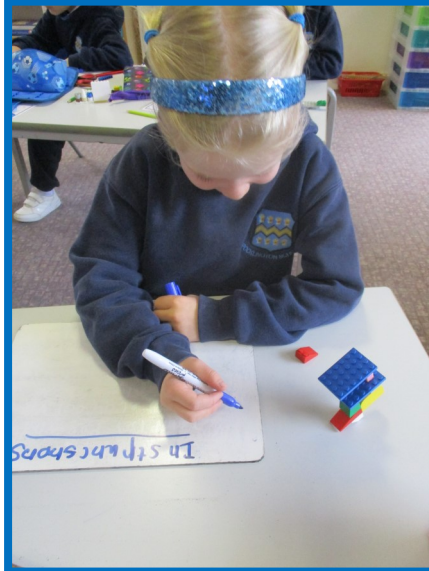
Writing instructions to build a Lego structure using bossy verbs and prepositions in Y2