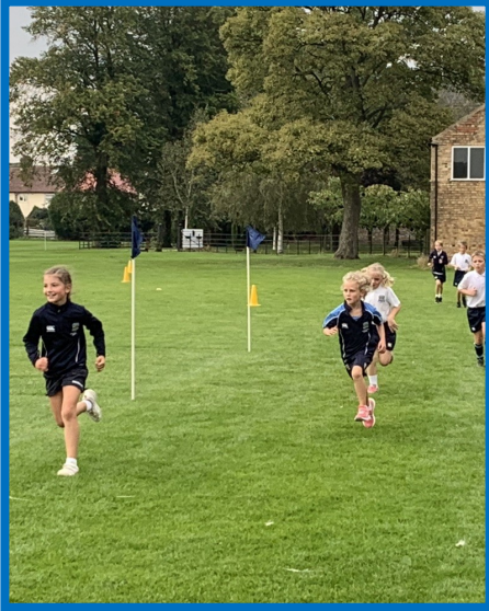
Enjoying cross country club after school on Tuesday