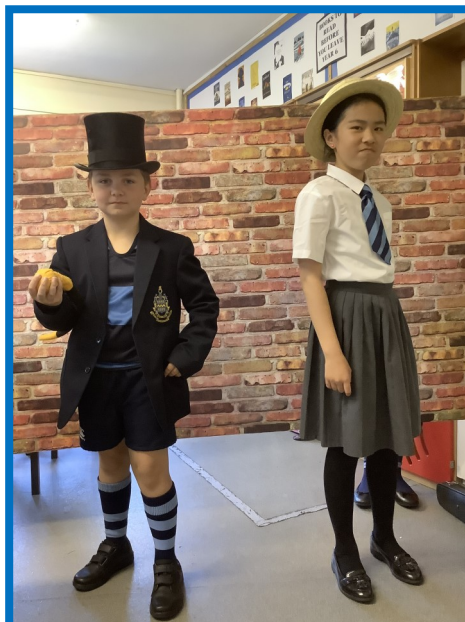
Refining their debating skills in Y6, arguing for and against Victorian Workhouses