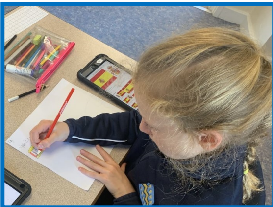
Y3 learning some interesting facts about Spain in their Spanish lesson!