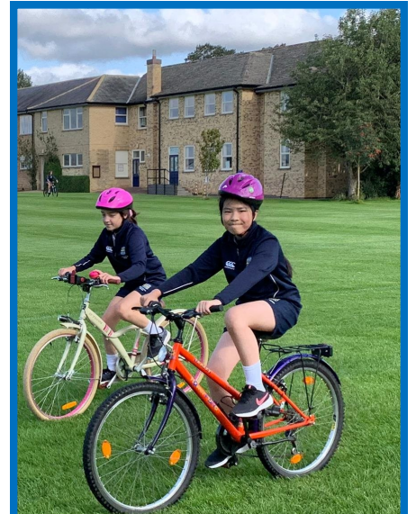
Taking part in the Year 5 and 6 Duathlon on Saturday