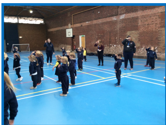
The children in the EYFS in PE this week—they were very excited to see the lollipop lady on their walk over to the sports hall!