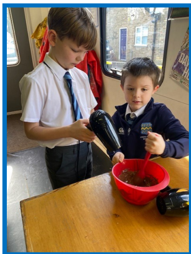
Year 3 investigating 'sweet tricks' and making their own chocolate lolly as part of their Chocolate Story topic (Charlie and the Chocolate Factory)