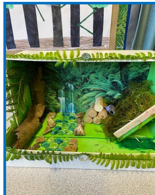
Just some of the wonderful 'Rainforests' that Year 5 have made