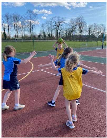
Enjoying Netball in the sunshine this week